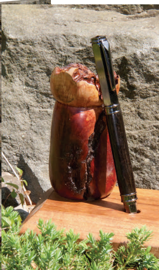
A Manzanita Tree - Amazing how something so unique comes from a desert scrub tree!