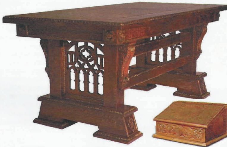
New Wave Gothic Library desk, a commission, was one of two designed along with a client. Handcarved Friesian Desk Box is an exact museum-quality reproduction.

There is extensive information, not only about the shop, but philosophy of restoration, history of period furniture and a glossary of woodworking terms, Revolutionary War and Civil War historical interpretations and demonstrations, on the Artisans of the Valley website: artisansofthevalley.com .